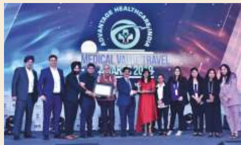
Medical Value Travel Specialist Hospital Spine Surgery) Winner Fortis Memorial Research Institute, Gurugram