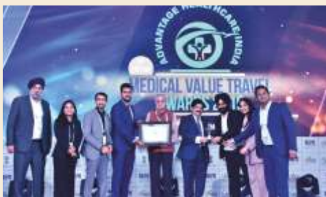
Medical Value Travel Specialist Hospital (Cardiac Surgery) Winner Fortis Escorts Heart Institute & Research Centre, Delhi