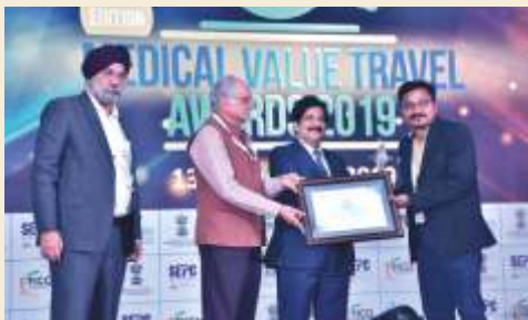
Ayurveda Centre of the Year Winner Sreedhareeyam Ayurvedic Eye Hospital and Research Centre, Kovalam