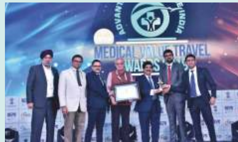
Medical Value Travel Specialist Hospital (Joint Replacement) Winner Shalby Multi Speciality Hospital, Ahmedabad