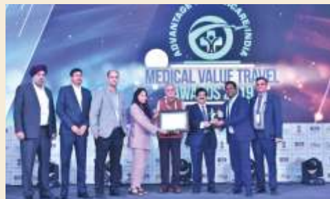
Medical Value Travel Specialist Hospital (Cardiology Interventional) Winner Fortis Escorts Heart Institute