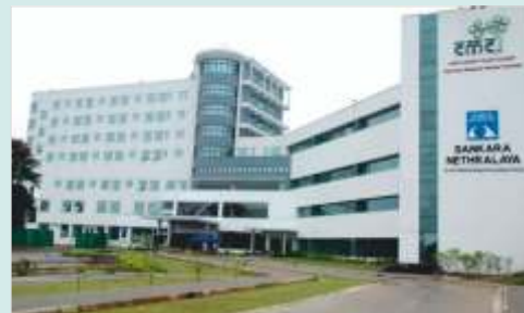
Medical Value Travel Specialist Hospital (Eye Surgery) Winner: Sankara Nethralaya, Chennai