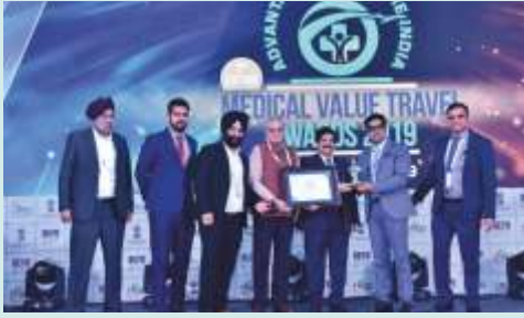
Medical Value Travel Best Case Study) Winner Fortis Hospital, Anandapur, Kolkata