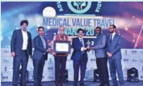
Medical Value Travel Specialist Hospital (Oncology) Winner Apollo Cancer Institute, Chennai