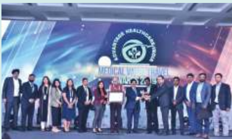
Medical Value Travel Specialist Hospital (Paediatric Cardiac Sciences) Winner Narayana institution of Cardiac Sciences, Bangalore