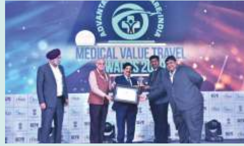
Medical Value Travel Emerging Specialist Hospital Winner Sri Ramakrishna Hospital, Coimbatore