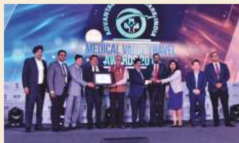
Medical Value Travel Specialist Hospital (Liver Transplant) Winner Indraprastha Apollo Hospitals, Delhi