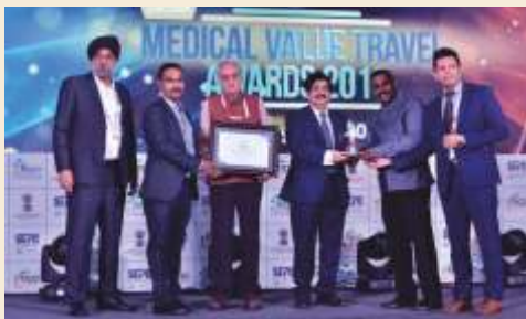
Medical Value Travel Specialist Hospital (Bone Marrow Transplant) Winner Apollo Cancer Institute, Chennai