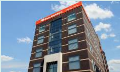
Medical Value Travel Specialist Hospital (Bariatric Surgery) Winner: Asian Bariatrics Hospital, Ahmedabad