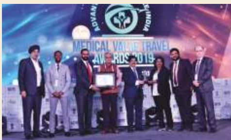
Medical Value Travel Specialist Hospital (Kidney Transplant) Winner Indraprastha Apollo Hospitals, Delhi