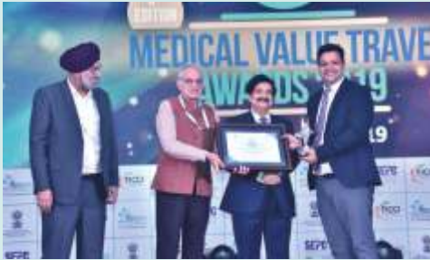
Medical Facilitator of the Year Winner medECUBE Healthcare India, Gurugram