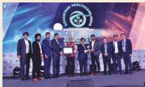
Medical Value Travel Specialist Hospital (Heart Transplant) Winner Fortis Malar Hospital, Chennai