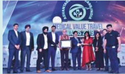
Medical Value Travel Specialist Hospital (Neurosciences) Winner Fortis Memorial Research Institute, Gurugram